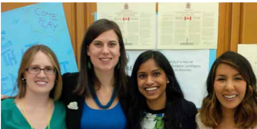
LEAF Ottawa event participants.