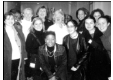
No Means No workshop in Toronto