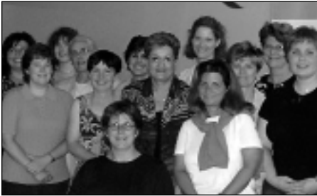
Sudbury Person's Day Breakfast Committee