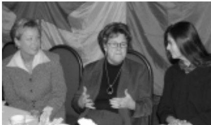
Sudbury Person's Day Breakfast