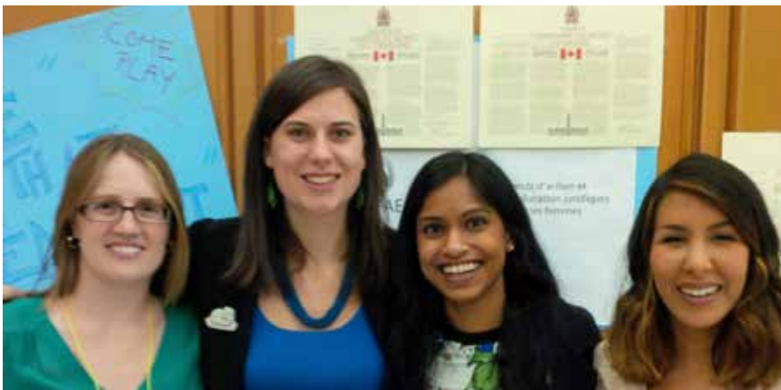
LEAF Ottawa event participants.