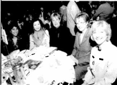
Scotiabank table at the 2004 Toronto Persons Day Breakfast

More than 4,000 LEAF supporters from across the country participated in Persons Day Celebrations this year. These events enable us to join together throughout Canada to hear the unique, diverse voices of women. They create an opportunity to listen to outstanding women, from authors to activists, and they create a moment to pause, reflect and discuss women's experiences and issues.