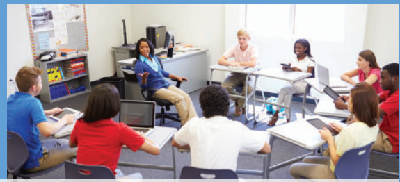
Public education is a key pillar in LEAF's approach to achieving substantive equality in Canada.