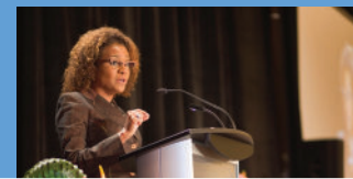
The Rt. Hon. Michaëlle Jean speaks at the 2012 Persons Day Breakfast Gala.

Submission criticizing Bill C-31: The Protecting Canada's Immigration System Act.