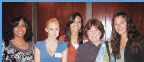
The Honourable Louise Arbour with youth at the 2008 Persons Day Breakfast Gala.

R. v. Mills – SCC upholds a law that limits the accused's access to sexual assault complainants' personal records.